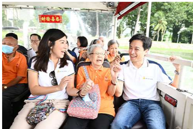
Big cheers erupted all around as the boat splashed into the sea.

Sharing love with the beneficiaries are staff volunteers across the Hong Leong Group of companies including City Developments Limited, Hong Leong Holdings, Millennium Hotels and Resorts, Hong Leong Finance, Hong Leong Asia and Hong Realty. Together with the seniors and volunteers, the event saw a total turnout of nearly 70 people.