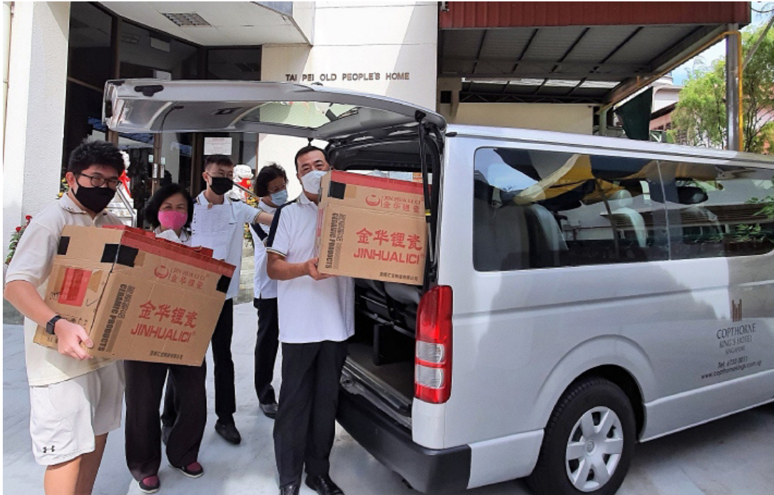
Hong Leong Foundation volunteers delivering lunch bento boxes prepared by Copthorne King's Hotel to Tai Pei Old People's Home.